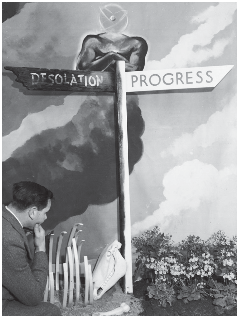
Figure 1. A flowering garden represents 'Progress' in an exhibition at Dorland Hall, London, depicting the two potential roads of atomic energy. The exhibition, part of the 'Atom Train', was the first to present atomic energy to the public and was sponsored by the British Atomic Scientists Association. 'A choice of future', 23 January 1947.