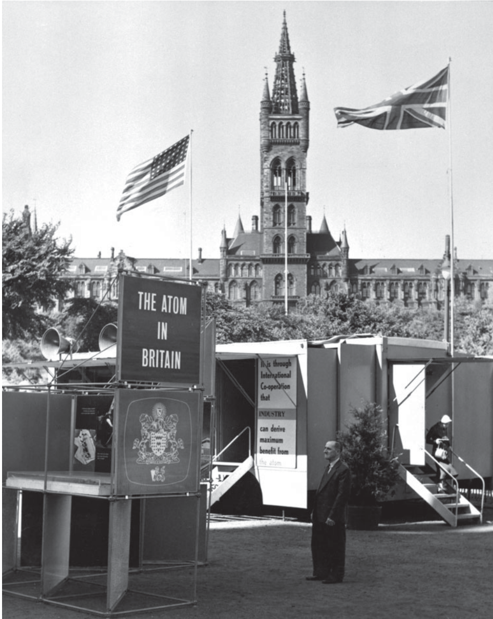
Figure 3. The Atoms for Peace bus tour visited Kelvingrove Park in Glasgow in 1955.

still able to assemble a guest list that included the American editor of Atoms for Peace Digest ; a representative of the United Kingdom Atomic Energy Authority; the man who designed the first medical accelerator cyclotron, then installed at Hammersmith Hospital; and Mr K.W. Clark from the Projects Department of the Ministry of Supply.